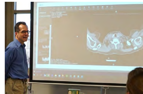
Image sharing pilot project