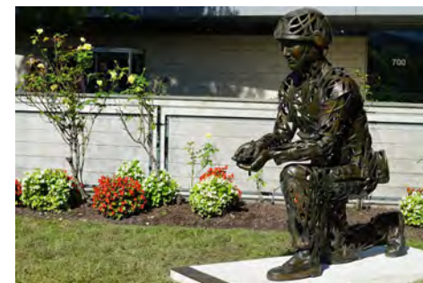
Fallen soldier memorial sculpture honors military donors